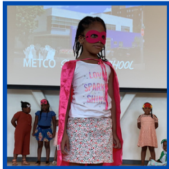
School-Aged Children (5-13)