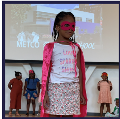
School-Aged Children (5-13)