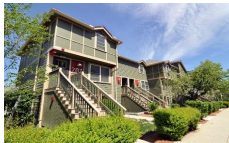
Roxbury Today (Madison Park Village III)

The survival of the Lower Roxbury community was at risk. Bulldozers were demolishing hundreds of homes, churches, and businesses through the City of Boston's urban renewal program. A small, but determined, group of activists fought back. Led by community members including Ralph Smith and C. Vincent Haynes, the group mobilized residents against the further destruction of their neighborhood. They created their own vision for the area and procured the resources they needed to rebuild their once-thriving community. This effort resulted in the creation of the Lower Roxbury Community Corporation in 1966 – with Ralph Smith as its founder and first Executive Director. The organization was a community-based, non-profit that independently developed affordable housing for low and moderate-income residents – making it one of the country's first Community Development Corporations