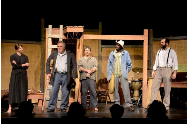
Mad River Theater Works, "Freedom Bound"