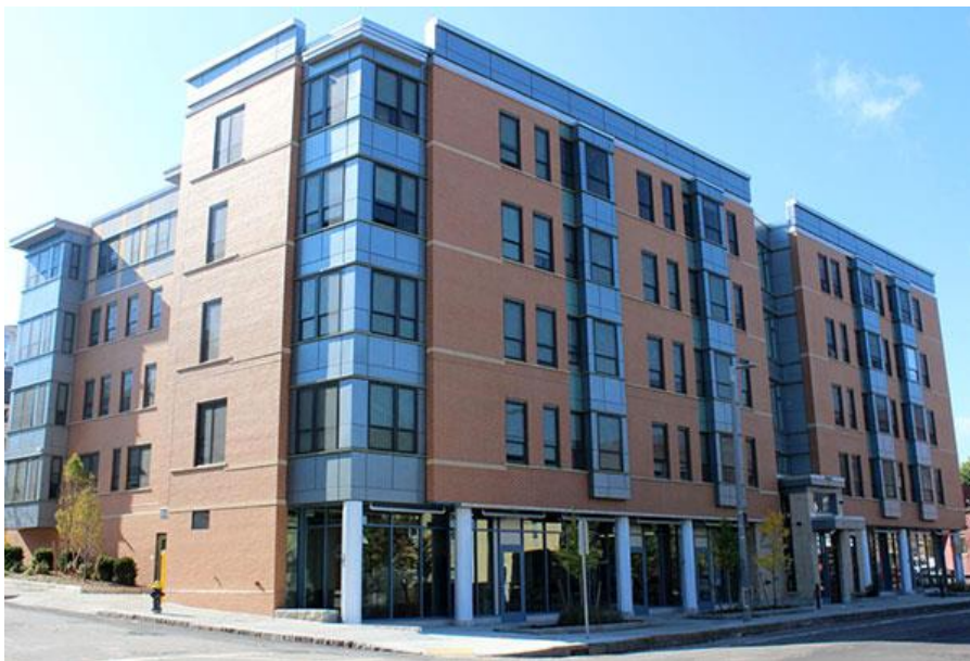
Dudley Greenville Apartments (Completed in 2014)