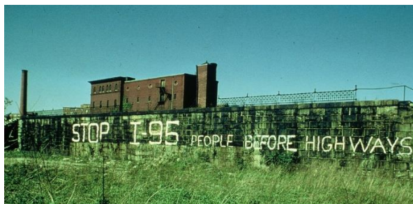
Roxbury in the 1960s

Madison Park Development Corporation (MPDC) was founded in the midst of crisis in the 1960s.